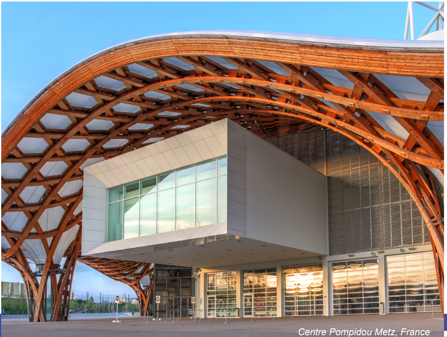
Centre Pompidou Metz, France